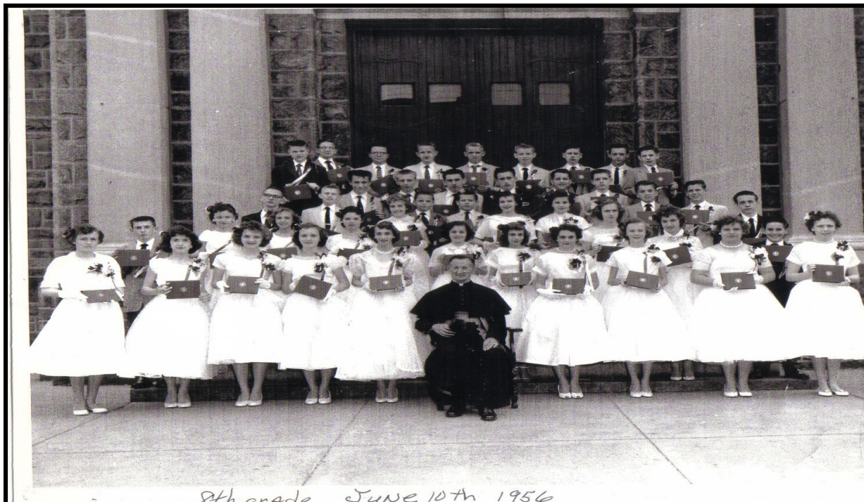
Saint Joseph's Grammar School 8th Grade Class dated June 10th, 1956