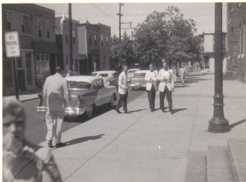
S. 10th Street in Front of St. Joseph's Church (circa 1958)