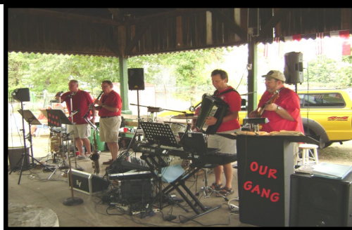
The "Our Gang" Band Performing at the Picnic